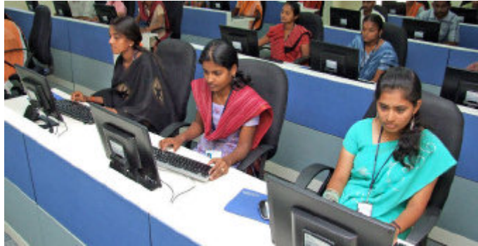
Outsourcing jobs being done at a BPO firm in a village in Krishnagiri district in Tamil Nadu

Initiative under Fosterera brings changes in Krishnagiri landscape